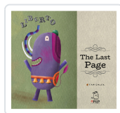
THE LAST PAGE CANIZALES