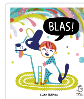
BLAS! (INGLES) HORMIGA, ELENA