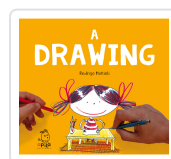
A DRAWING MATTIOLI, RODRIGO