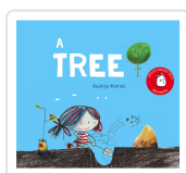
A TREE MATTIOLI, RODRIGO