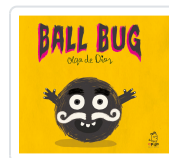
BALL BUG DE DIOS, OLGA