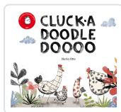
CLUCK A DOODLE DOOOO OTTE, NURIA