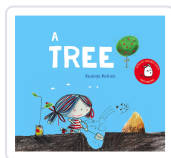
A TREE MATTIOLI, RODRIGO