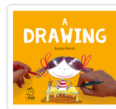
A DRAWING MATTIOLI, RODRIGO