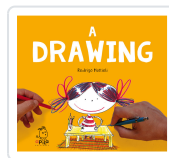
A DRAWING MATTIOLI, RODRIGO