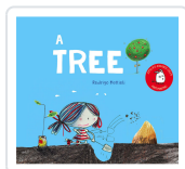
A TREE MATTIOLI, RODRIGO