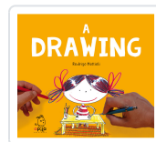
A DRAWING MATTIOLI, RODRIGO